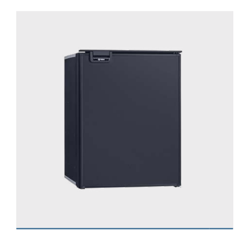
DC85X 85L 12V / 24V