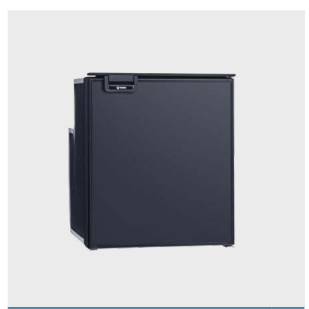
DC65X 65L 12V / 24V