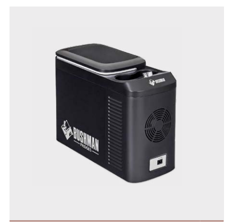
Roadie 15L 12V / 24V FRIDGE / FREEZER