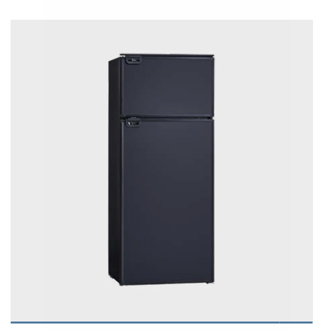
DC230X 230L 12V / 24V