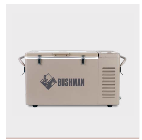
Original Bushman SC35 35L 12V / 24V FRIDGE / FREEZER