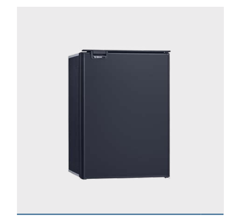
DC130X 130L 12V / 24V