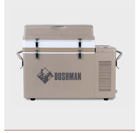
Original Bushman SC35–52 35L–52L 12V / 24V FRIDGE / FREEZER