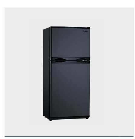
DC190L 190L 12V / 24V